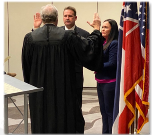
Taking the Oath of Office on Jan. 2, 2020

Integrated Resource Plan (IRP) is a type of utility planning process that develops long-range resource plans by seeking to identify an optimal combination of resources to meet forecasted load requirements at the lowest reasonable total cost, subject to various objectives and constraints. Mississippi Power Co. (April 15) and Entergy Mississippi (June 15) will each be filing their initial IRP's this spring. In addition, each utility shall conduct a technical conference to provide an overview of the IRP process no later than 45 days prior to the filing of its IRP.