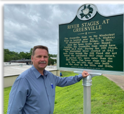
Stopped for a scenic view at the Greenville waterfront on the mainline levee.