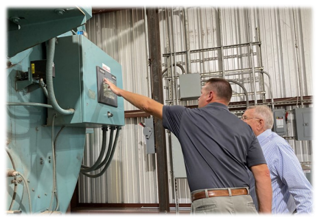
The new energy-efficient boiler system uses modern technology to increase thermal efficiency and reduce the quantity of fuel the boiler consumes each day.

Yesterday, I had the opportunity to visit the Shuqualak Lumber mill in Noxubee County to tour the facility, observe the energy-saving projects, and help present to Shuqualak Lumber officials a rebate