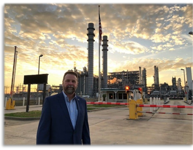
Site visit to Plant Ratcliffe power station near DeKalb, MS

of the special people and places of Mississippi.