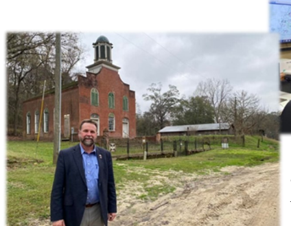
Toured the headquarters of Southwest Mississippi Electric Power Association and visited the site of the former town of Rodney, MS. Hard to believe

this was once a town thriving in art, culture, and commerce. A cannonball is still embedded in the front wall of the church.