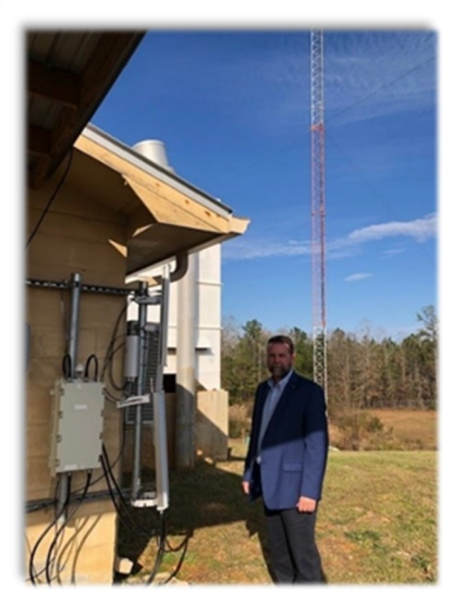
Inspecting the equipment that delivers wireless internet service to customers of North Lauderdale Water Association