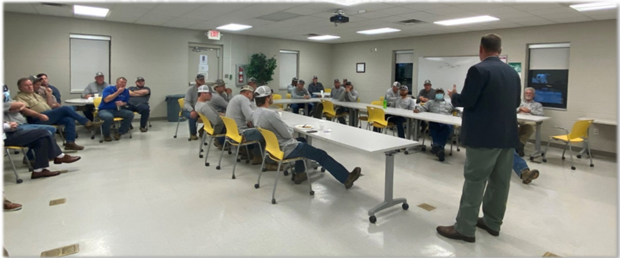
Sharing words of appreciation with Southern Pine Electric linemen at the Brandon District location.

This week, I had the opportunity to visit with the linemen of Southern Pine Electric's Brandon District. Whether it is the detrimental effects of hurricanes, ice storms or tornado-producing thunderstorms, the linemen of Southern Pine Electric work quickly to restore power to their customers in what is likely the largest rural electric cooperative service area by geographic footprint in the state. During the Lineman Appreciation Breakfast, Southern Pine leadership also introduced a new Lineman Video showcasing the grueling conditions that linemen must work in to restore electric service to its member-customers. Check it out and turn up the volume! https://www.youtube.com/watch?v=dIaJ4QvUtYU