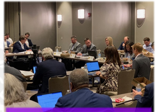
Meeting of the OMS Board. Flanked by Commissioners from Michigan and North Dakota.

The Board of the Organization of MISO States (OMS) also took advantage of having a large number of its members present to work on matters key to sustaining a reliable, resilient transmission grid across the midsection of the U.S. This meeting primarily focused on adopting a position statement that will guide MISO and its stakeholders in the potential revision of the technical tools and market mechanisms that ensure electricity resource adequacy and generator reliability in the region.