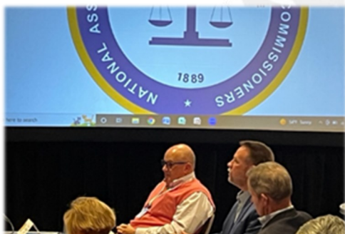
Receiving an update on nuclear research with fellow commissioners from New Jersey, Montana and Illinois.

I also participated in meetings of those committees for which I am a member. These include the Nuclear Issues Committee where we received an update on the progress of Plant Vogtle in Georgia.