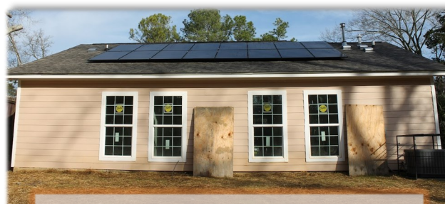
The 6.8 kW solar PV system is shown here.

This new home in Jackson, MS has a high-efficiency natural gas furnace, high-efficiency natural gas tankless water heater, high-efficiency SEER air conditioning system, sealed air ducts, R-38 attic insulation, R-23 wall insulation, .29 U-value windows, Energy Star appliances, 6.8 kW solar photovoltaic system and other money-saving features. The estimated average monthly combined utility bills for gas and electric will be $60-$75 per month.