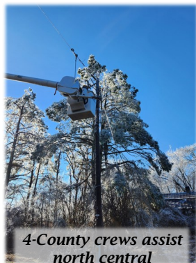
4-County crews assist north central Mississippi co-op

If you were unable to attend the Open Docket Meeting and missed the live stream, a recording of the meeting can be found here .