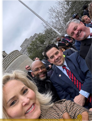
Congratulations to Governor Tate Reeves on his inauguration as Mississippi's 65th Governor! Tuesday, January 9, 2024