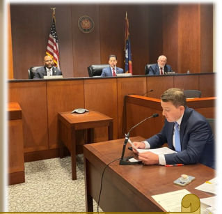
The Mississippi Public Service Commission conducted the first monthly docket meeting of the year on January 18 to discuss pending matters on the docket. I was thrilled to join my colleagues as we continue the work of the Public Service Commission.