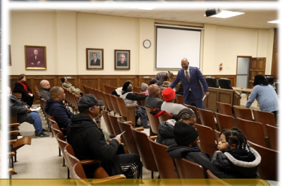
As we wrapped up another heartwarming commemoration of Reverend Dr. Martin Luther King Jr. on Monday, January 15, I want to extend a heartfelt thank you to everyone in Leake County. This year's events - the beautiful community march and community town hall - have not only honored Dr. King's memory but also echoed his message of unity, equality, and justice.