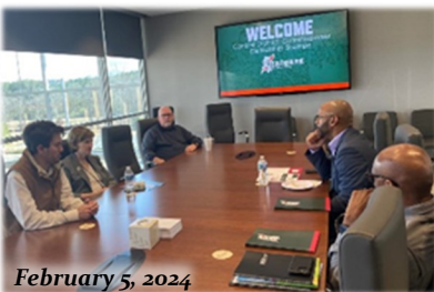
February 5, 2024

We invite you to follow along on our Facebook and additional social media channels as we've recently shared