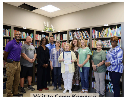
Visit to Camp Kamassa