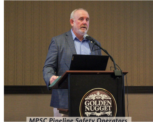
MPSC Pipeline Safety Operators Conference - May 13th, Biloxi