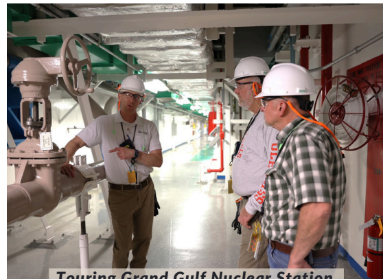
Touring Grand Gulf Nuclear Station - May 15th, Port Gibson