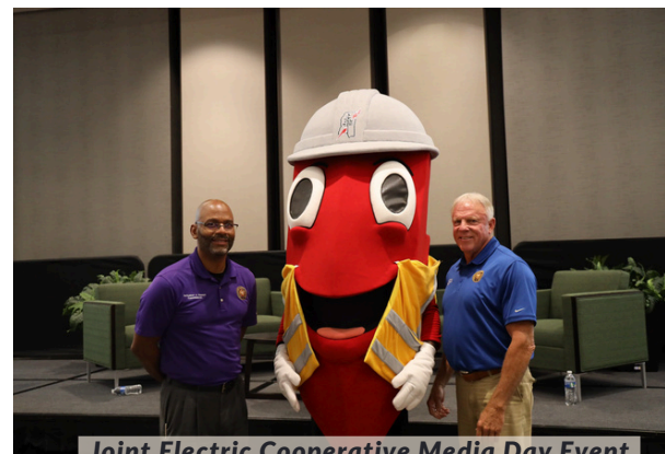
Joint Electric Cooperative Media Day Event hosted by Southern Pine Electric