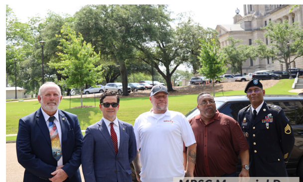
MPSC Memorial Day Flag Folding Ceremony