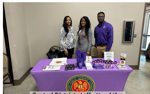
Central District staff attend the Copiah County Triad Meeting