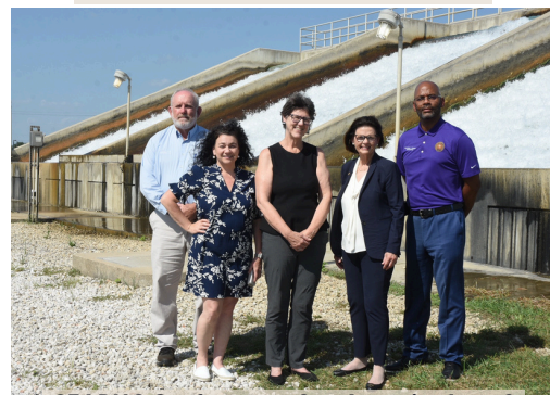
SEARUC Conference - San Antonio, June 9