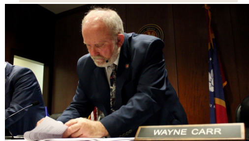
June Open Meeting - Jackson, June 17