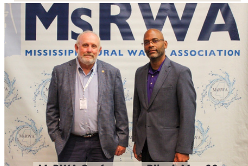
MsRWA Conference - Biloxi, May 29